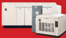
Cummins Connect Series home standby generators

Lightning was powering through the clouds outside. Thanks to your planning, their story time, and life as you know it, continued inside.