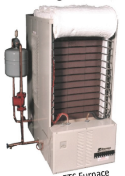
ETS Furnace (cutaway view)

www.sussexrec.com or call us at 973.875.5101