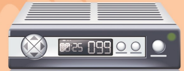
CABLE/SET TOP BOX